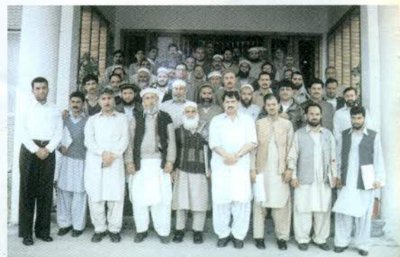
Participants of an SOPs training workshop held in Abbottabad

One of the objectives of EDSP was to institutionalize the drug management interventions in the government departments. PC-1 of essential drug management is an important document towards this direction. A number of meetings were held at provincial level to start the work on development of PC-1. During this process, Secretary Health, DG Health, Additional Secretary Health, Chief Planning Officer and other concerned staff in both provinces were lobbied. An opinion was built up that drug management was a neglected area and needed proper attention. A concept paper was developed on preparation of PC-1 for the continuation of activities undertaken by EDSP in both provinces, separately. Copy of the concept paper was circulated among all concerned. After a meeting with Chief Planning Officer, it was agreed that the concept paper should be supported by specific costing, which would be submitted to the P & D department for consideration and as an approval for preparation of PC-1. All the key players involved in the preparation of PC-1, in each province, were consulted, time and again, during the entire process. The consultation process resulted in building a judgment that drug management has not received appropriate attention in the past and this is the right time for this area to be focused upon. Based on these efforts, a PC-1 is in the final stages of development in each province. The finalized document would be submitted to the respective government very soon.