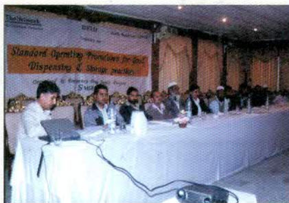
Workshop on Standard Operating Procedures for dispensing and storekeeping underway in Swat

In order to provide impetus and guidance to the Emergency Drug Supply Project (EDSP), a