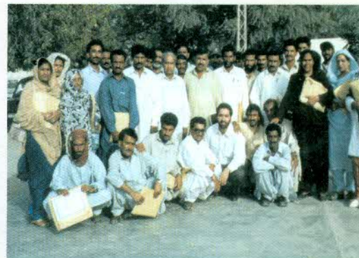
Participants of SOPs workshop held in Lasbela, Balochistan

These emergency medicines have been purchased for the districts and at present delivery at relevant locations is underway.