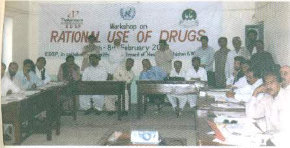
Rational Use of Drugs workshop being held in Lasbela, Balochistan

activities carried out by EDSP and their progress to date.